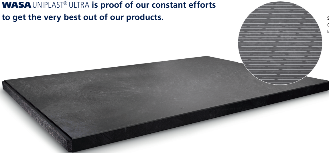
Strong core Glass fibres ensure high load-bearing capacity.

WASA UNIPLAST® ULTRA is proof of our constant efforts to get the very best out of our products.