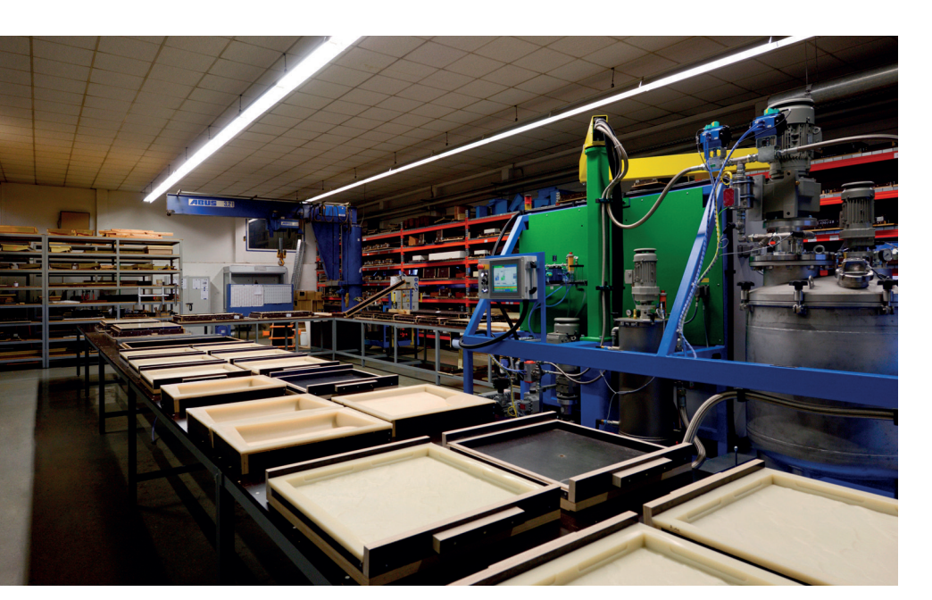
Customers in the concrete block making industry are guaranteed trouble-free and reliable production by Wasa wetcast.

Wasa supplies a wetcast sampling kit as a special offer for the production of proprietary polyurethane moulds. The kit allows customers to mix the materials themselves and thus to test their project in advance in very small production runs. The wetcast sampling kit contains all the materials necessary for this - in the correct mixing ratio and naturally from Rampf Giessharze.